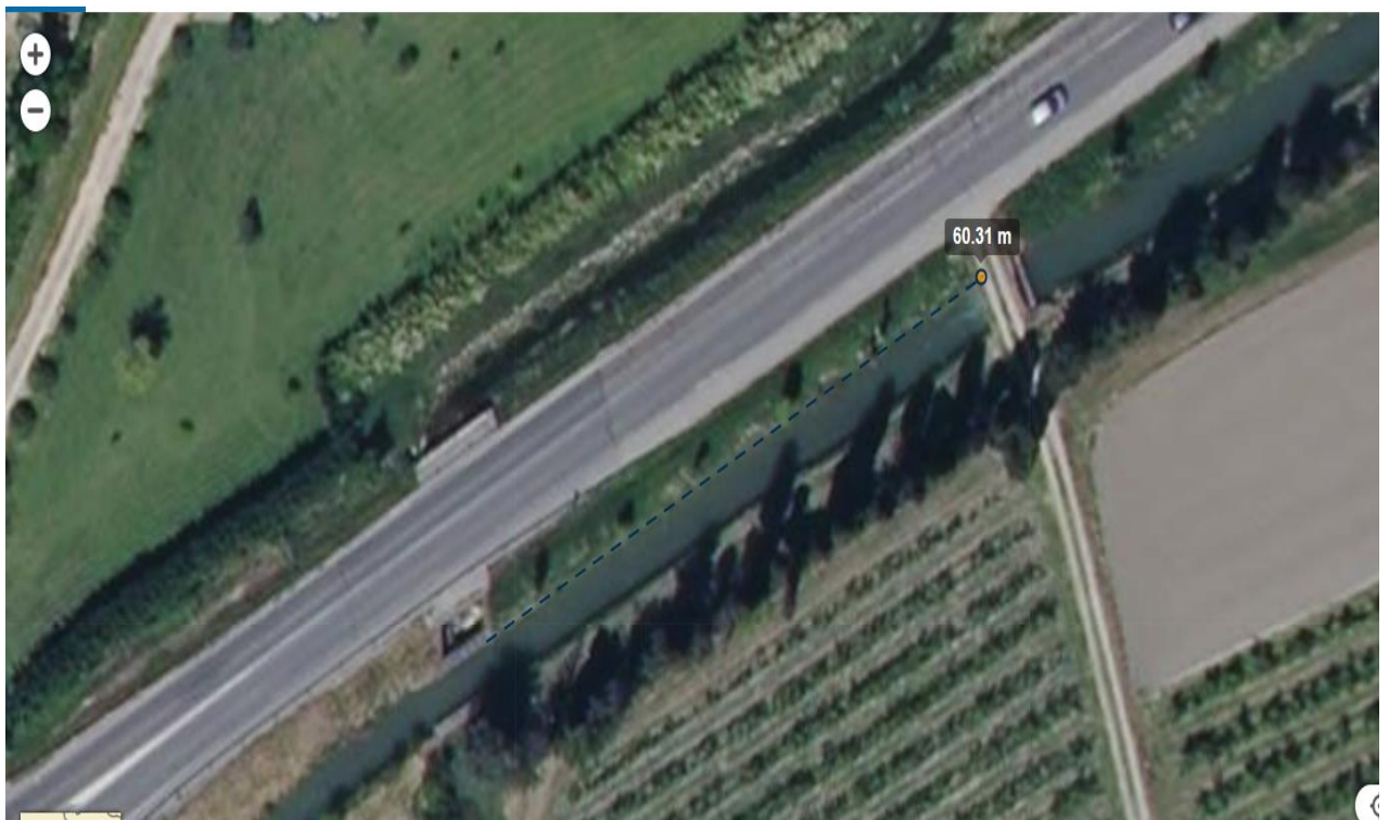
Réhabilitation berge aval Cadillan